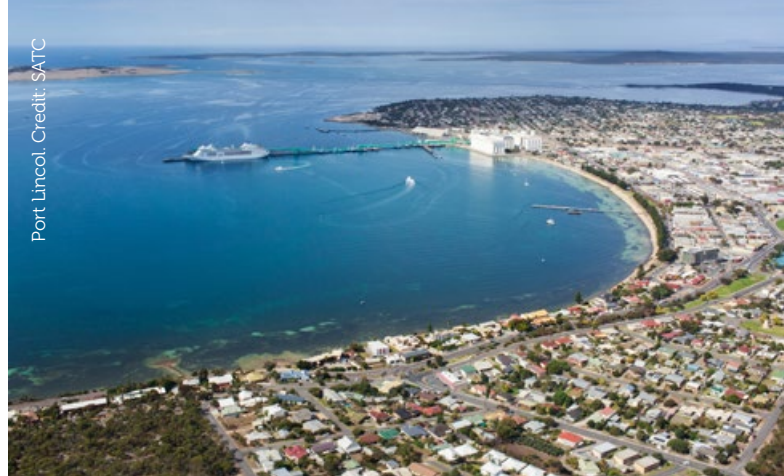
Port Lincoln

We always plan this tour for this time of year for one major reason – the Blue Lake is blue! Tucked inside the crater of a former volcano, it's famous for its colour, but it only changes to this brilliant blue in late spring. Now, any lake inside a volcano's crater is impressive no matter its colour, but when this lake turns blue it becomes something altogether more spectacular!