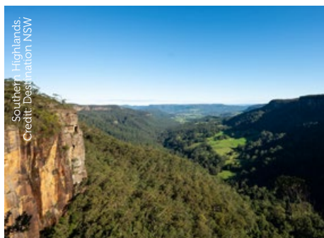
Southern Highlands

This is a unique opportunity to witness the dazzling display of lights, music and ideas that transforms the city into a wonderland of creativity and innovation. You will enjoy a cruise on the Sydney Harbour, where you can see the iconic landmarks of the Opera House and the Harbour Bridge illuminated by the festival lights. This is a tour that you don't want to miss!