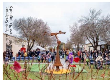
Generosity of Spirit Sculpture

Situated on the Murray, Swan Hill and Echuca have a fascinating history that stems from life on the river. Visiting both towns, we enjoy a Paddleboat cruise, step back in time at a pioneer settlement and stop in at Lake Boga – a stretch of water used by the flying boats! This scenically beautiful area offers a perfect mix of Australian history, nature, and culture.