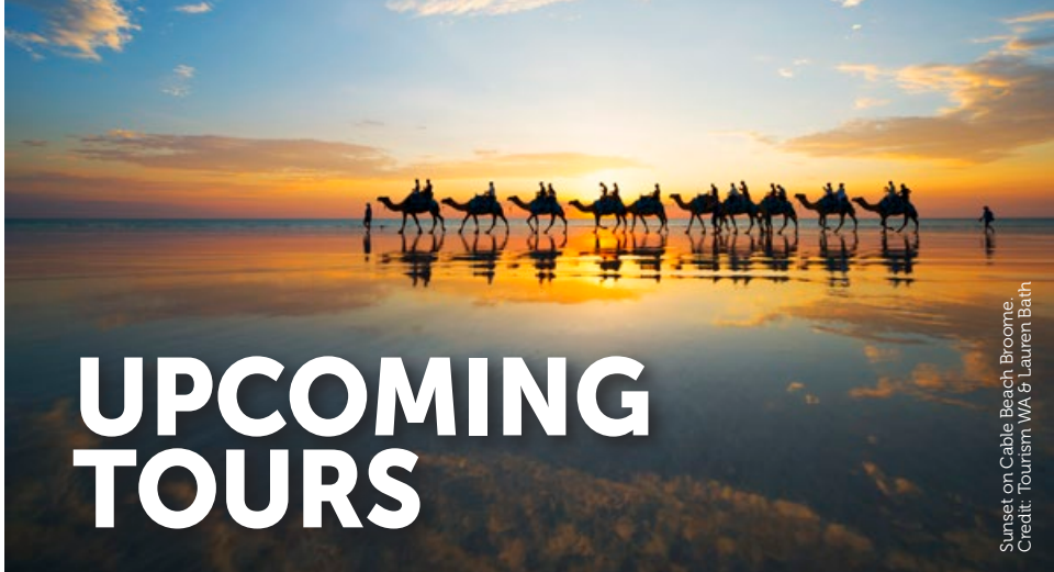
Sunset on Cable Beach, Broome.