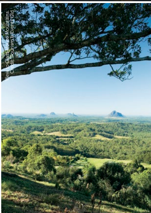
View of Glass House Mountains.