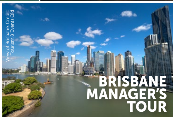
View of Brisbane.