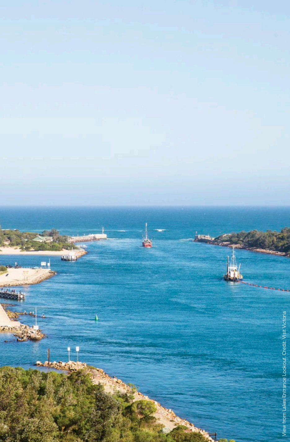
View from Lakes Entrance Lookout.